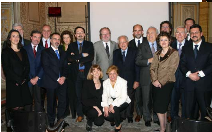
Italian Fellows celebrate EF Day 2009