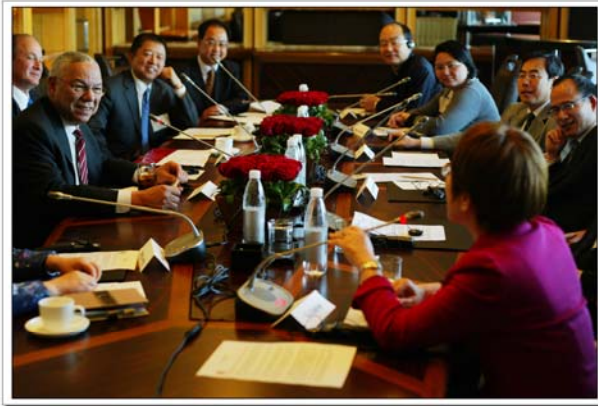
Gen. Powell discusses 2011 Single Nation Program—China

At a gathering of Fellows in Shanghai in early May, General Powell announced plans for a China Single Nation Program in 2011, to be preceded in September 2011 by an international conference with the theme “CHINA ON THE WORLD STAGE”. Key Fellows in China, alumni Fellows and friends from the international network will participate in discussions on natural resources/the environment; global finance/trade; human capital development; and technology.