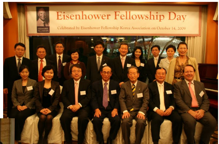
2009 EF Day Celebration in Korea