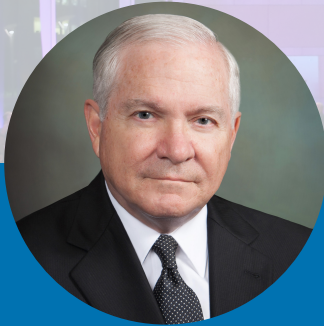
Dr. Robert M. Gates EF Chairman Former U.S. Secretary of Defense