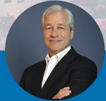
Jamie Dimon 2021 Eisenhower Medal for Leadership and Service