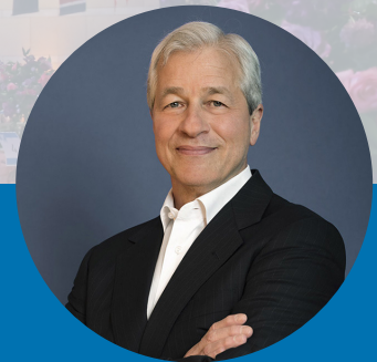
Jamie Dimon 2021 Eisenhower Medal for Leadership and Service