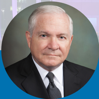
Dr. Robert M. Gates EF Chairman Former U.S. Secretary of Defense